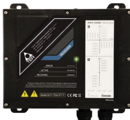
HML 260 x 272 x 96 mm 2950 g