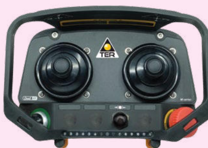
Simple tower crane