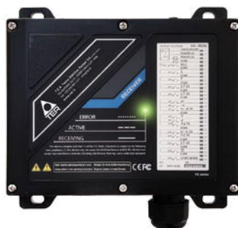
HS BLACK 184 x 190 x 64 mm 1795 g