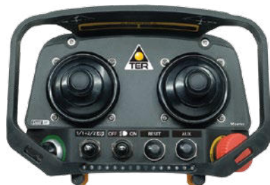
Bridge crane / Simple tower crane / Advanced tower crane 200 x 141,3 x 139 mm ~ 1036 g